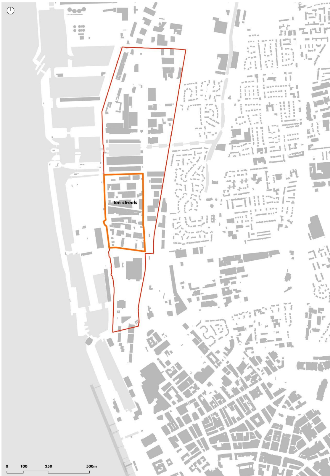
Figure 1.1: Location of the Ten Streets SRF Area 13